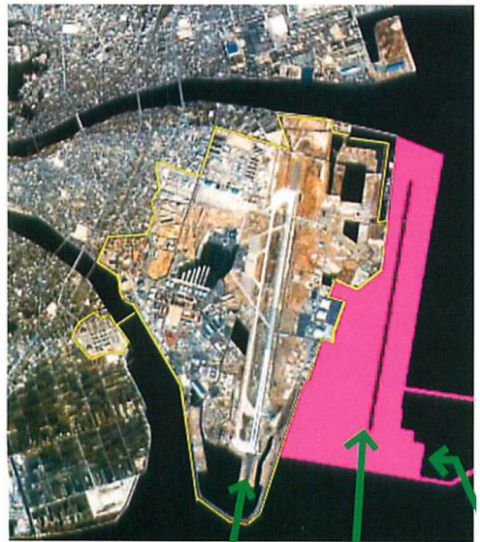
Old runway New runway Large wall

Today, despite a financial crisis that is causing severe cuts to welfare and medical benefits, the Japanese government continues to invest tremendous sums in the "sympathy budget" for US armed forces.