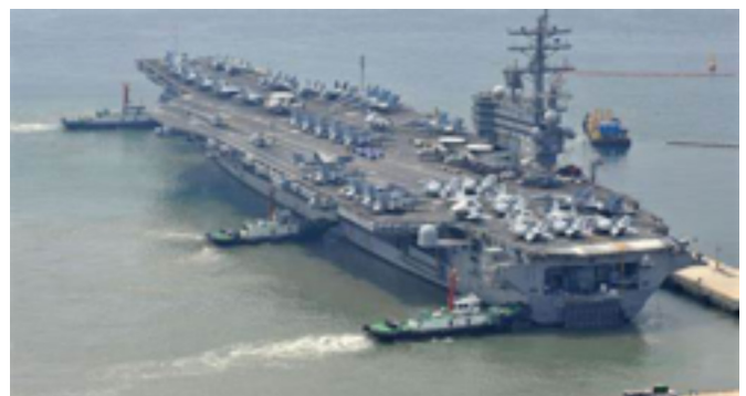
The nuclear-powered aircraft carrier Ronald Reagan

In October 2019, the Hiroshima High Court has found this noise to be illegal because the suffering exceeds reasonable limits of endurance for residents. And yet, because the noise is produced by the US military, suspensions of flights have not been allowed. Thus, residents around the base and far further afield are continually exposed to explosive noise.